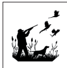
i shot it