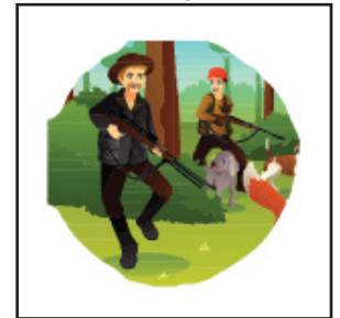
let's go hunt