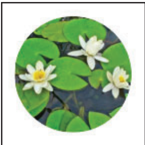
lily pads oskihtīpa ᐅᐱᐱᐱᐱ