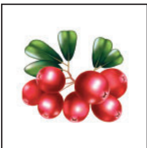
low bush cranberries wīsakīmina ᐅᐱᐱᐱᐱ