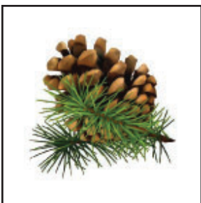
pine cone wasaskwīto ᐅᐅᐅᐅᐅᐅ