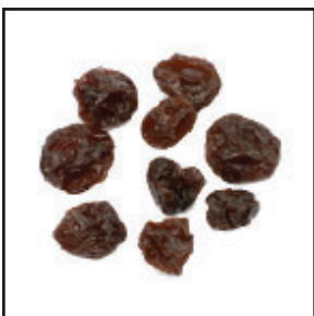
raisins sōminisak ᐅᐅᐅᐅᐅᐅ