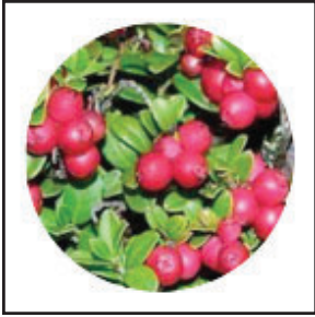
moose berries mōsōmina ᐱᐅᐅᐅ