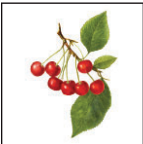
pin cherries pasīsāwimina ᐅᐅᐅᐅᐅᐅ