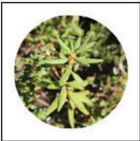
muskeg tea plant maskīkopakwa ᐱᐅᐅᐅᐅᐅ