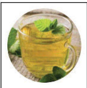
mint tea amiskowīkaskwa ᐅᐱᐱᐱᐱᐱᐱ