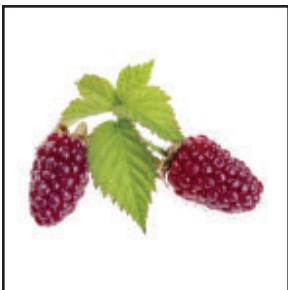
logan berries okīsikomina ᐅᐱᐱᐱᐱ