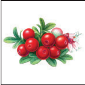
muskeg berries maskīkomina ᐱᐅᐅᐅᐅ