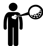
oṭāy ṭ ḡmikṭṭ