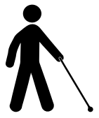
tkā ṭ wāpit