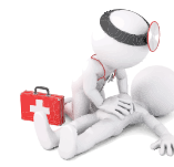
ṭ kakwṭ ṭh̄ṭh̄ṭpitat