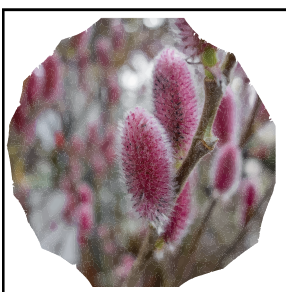
mīkohmīpisī red willow