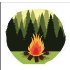
fire iskotīw ᐅᐅᐅᐅᐅ