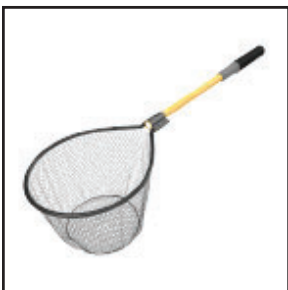
fishing net kwāpahikanāthapi ᓂᓴᓂᓴᓂᓴᓂᓴᓂᓴᓂ