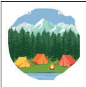
camp kapīsowin ᐅᐅᐅᐅᐅ