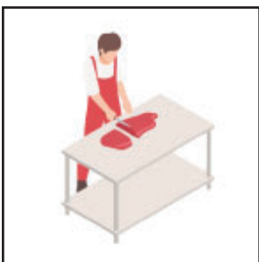
cut manisa ᐱᐅᐅᐅ