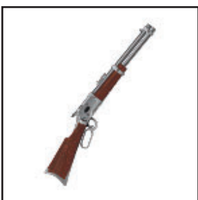
gun pāskīsikan ᓂᓴᓂᓴᓂᓴᓂᓴᓂᓴᓂ