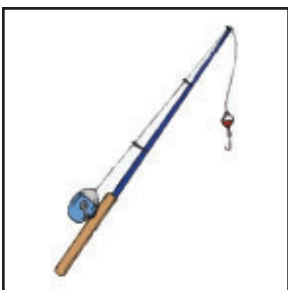
fishing rod kwāskwīpicihkan ᓂᓴᓂᓴᓂᓴᓂᓴᓂᓴᓂ