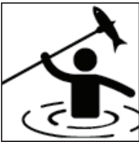
fishing nācihkinosīwī ᐃᓯᐅᓂᓴᓂ