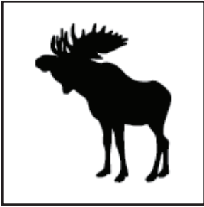
calling moose kitowaswī ᐱᐅᐅᐅᐅ