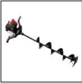
auger pīmahikan ᐅᐱᐃᐅᐅ