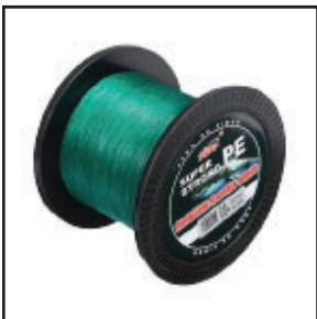
fishing line kwāskwīpicikanīyāpiy ᓂᓴᓂᓴᓂᓴᓂᓴᓂᓴᓂ