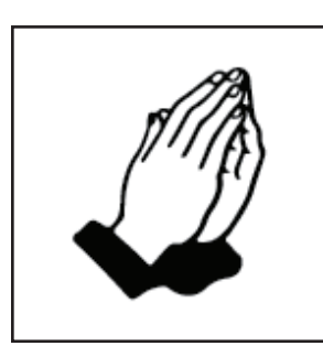
and the glory mīna kiskīthākosiwin ٦ݮ ₽▫٩≒ᲫᲫ죠ः